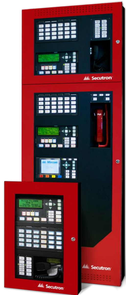
MMX Mass Notification Systems – Autonomous Control Unit (ACU) and Local Operating Console (LOC).