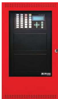
UB-1024DS with a DOX-1024DSR

Designed for peer-to-peer network communications, the various MMX network panels allow for a maximum of 63 nodes, while providing reliability, flexibility and expandability.