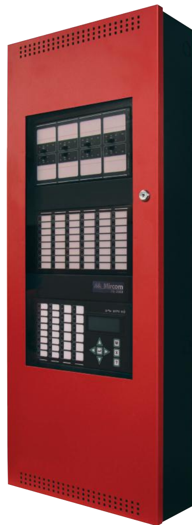
FX-2003-12NXTDS in a BBX-1024XTR enclosure (with optional DSPL-420-16TZDS Main Display module)

MMX complies with the latest fire codes and standards, for control units (listed with UL 864, 9th Edition and ULC S527) and installation (NFPA, ULC S524). FM certified.