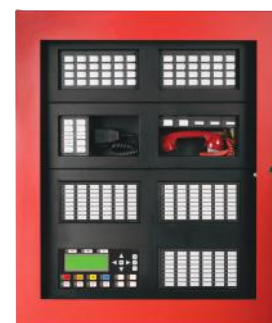
BB-5008 with a DOX-5008MR